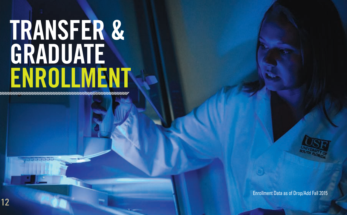
Enrollment Data as of Drop/Add Fall 2015